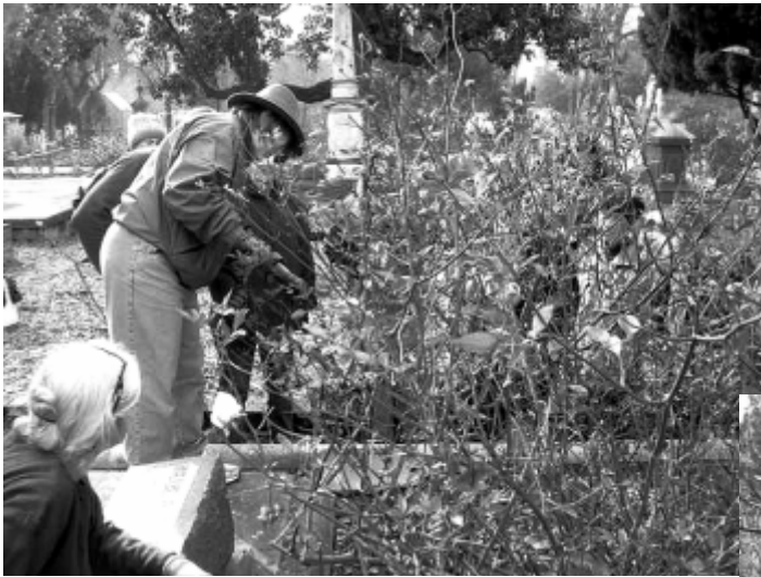
Cass's Demonstration ↑